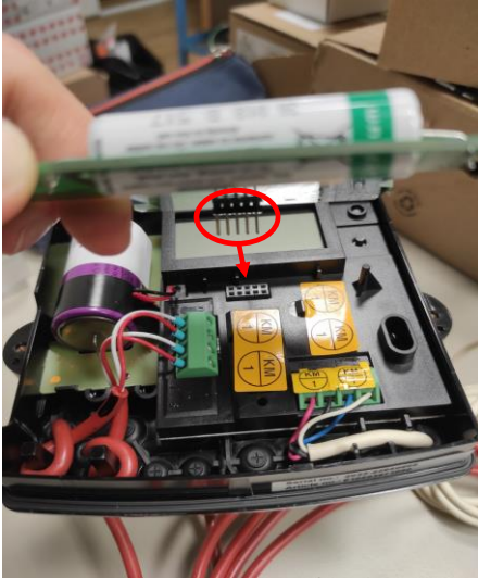
Connect the pins on the meter

μWiotys first compatible version 2.4.0 μWiotys device reference CMI4130